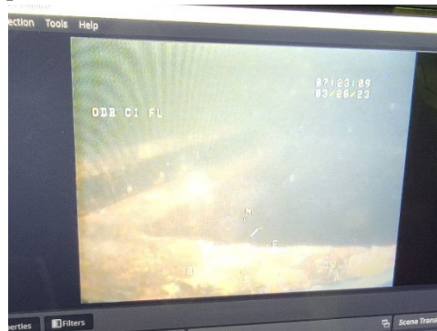
Figure 2. CI FG6-18 diffuser missing hatch.