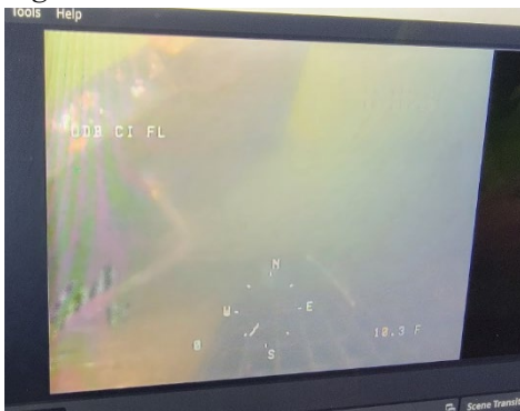
Figure 3. CI FG6-18 diffuser dislodged hatch.